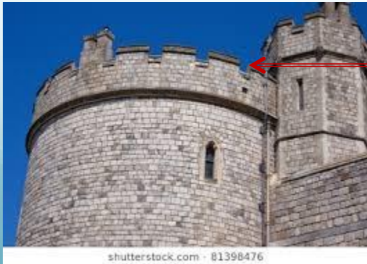
→ Crenellated Parapets